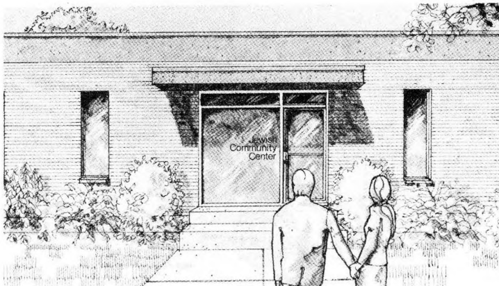
57 Ashmont Street 1982