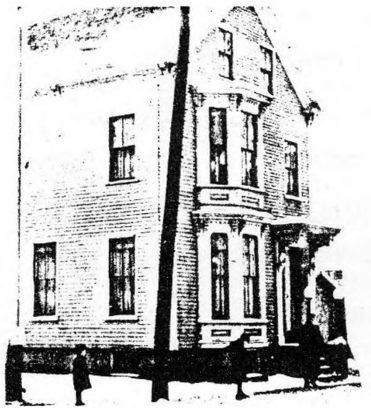
22 Wilmot St. 1922-1938